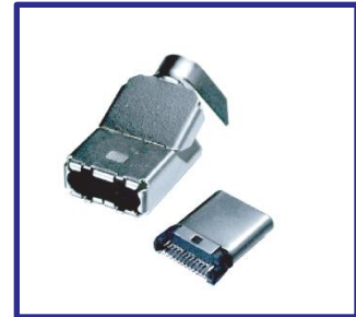
USB-C31-PLUG-BK USB Type C Cable Mount Plug