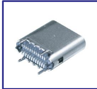
USB-C31-S-VT-CS2-BK USB Type C Vertical PCB Surface Mount