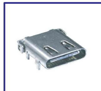
USB-C31-S-RA-CS1-BK-SS USB Type C R/A Short Body, Top PCB Mount