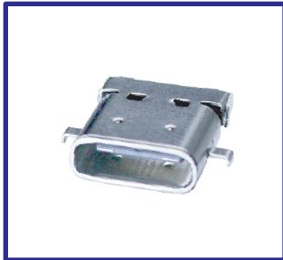
USB-C31-S-RA-EH2.0-BK USB Type C R/A Mid PCB Mount