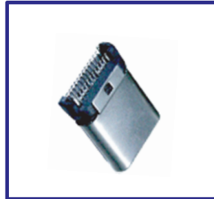
USB-C31-PLUG-BK-PCB USB Type C Plug Vertical PCB Mount