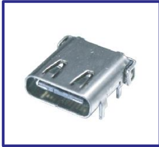
USB-C31-S-RA-CS2-BK USB Type C R/A Long Body, Top PCB Mount

All in one solution for your Power, Video and Data requirements