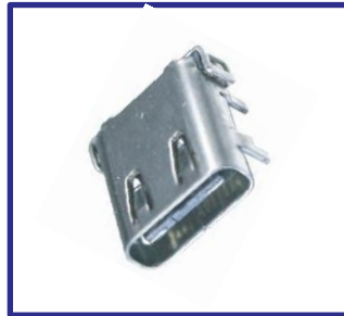
USB-C31-S-RA-BK USB Type C R/A, Extra Shield Pins Top PCB Mount