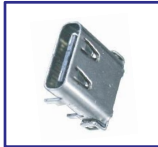
USB-C31-S-RA-CS1-BK USB Type C R/A Top PCB Mount